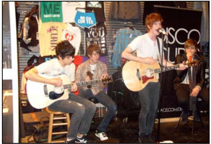
WHY DON'T YOU SURPRISE ME? Disco Curtis rocks out at the Towne West Hot Topic in Wichita. After the acoustic concert the band held a meet and greet with fans.

If you're a lover of good music, I highly recommend checking out Disco Curtis . You can find them on their MySpace page ( www.myspace.com/discocurtis ) or their YouTube channel ( www.youtube.com/user/DiscoCurtis ).